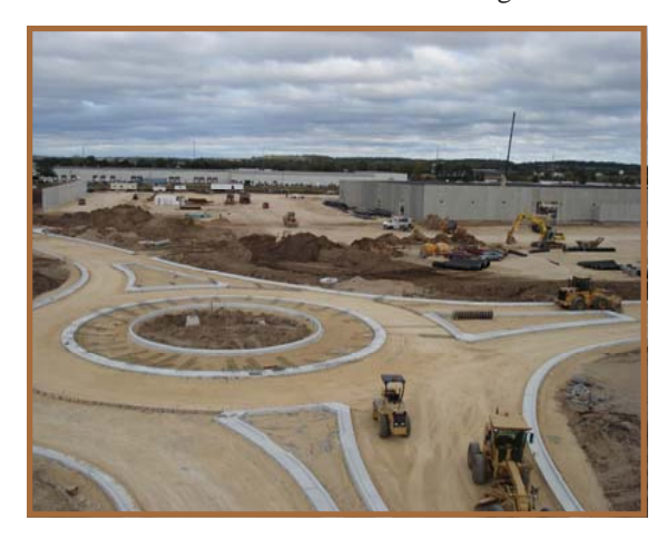
Pictured above is the new roundabout under construction on Morse Street. Construction is expected to be completed in the Fall of 2007.

Two modern roundabouts will be completed in Janesville in 2007. This brochure is meant to help Janesville citizens understand and navigate them.