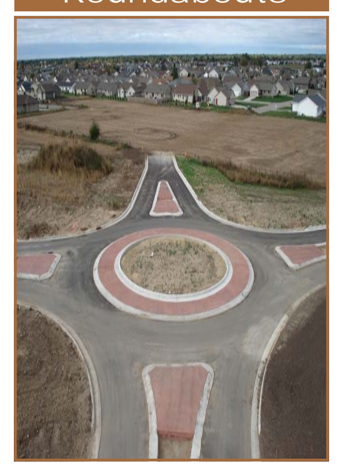
A guide for using Janesville's roundabouts.