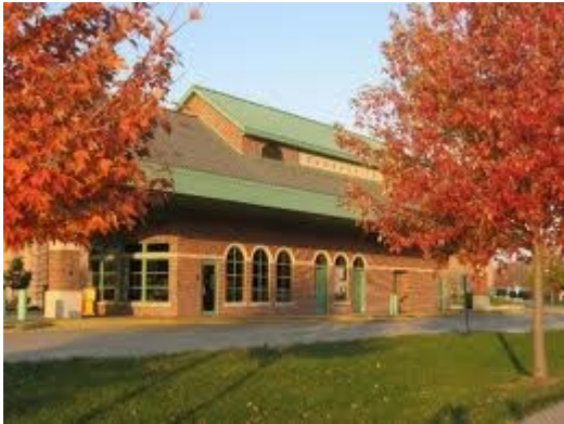
Janesville Transfer Center

Call (608) 757-5408 to schedule your training!