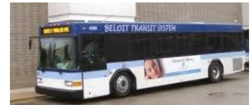
City of Beloit bus

All residents of Rock County are eligible for training sessions, all you need to do is call to schedule a training!