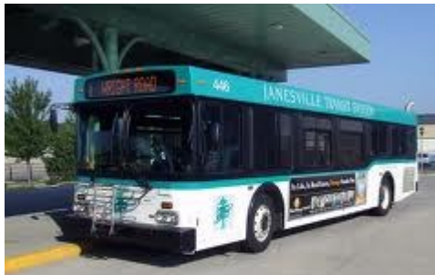
City of Janesville bus

Most trainings include classroom instruction and a free training ride on public transit!