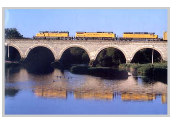
Five Arch Bridge, Towns of Turtle and Tiffany

Rock County is home to many historic sites and buildings that add charm and historic interest to the area. Certainly, all but the most infrequent visitor to Rock County is aware of the Tallman house in the City of Janesville, the Five Arch Bridge located in the Town of Turtle or historic Beckman Mill in the Town of Newark. These locations along with others, (see Figure 4.1) offer a step back in time and a cultural learning experience.