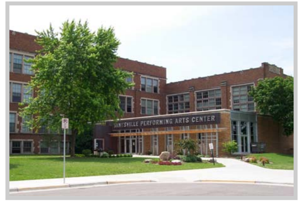
Janesville Performing Arts Center, City of Janesville

Rock County has a wide array of cultural activities, events, and performances that offer entertainment as well as an opportunity for cultural awareness to its citizens and visitors. From theatre to musicals the Rock County area is home to many facilities and groups dedicated to the performing arts and entertainment (see Figures 4.3 and 4.4).