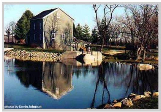
Beckman Mill, Town of Newark