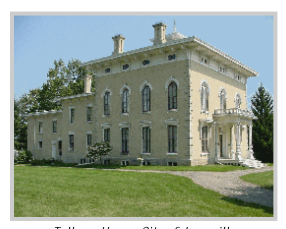
Tallman House, City of Janesville

Rock County is home to many historic sites and buildings that add charm and historic interest to the area. Certainly, all but the most infrequent visitor to Rock County is aware of the Tallman house in the City of Janesville, the Five Arch Bridge located in the Town of Turtle or historic Beckman Mill in the Town of Newark. These locations along with others, (see Figure 4.1) offer a step back in time and a cultural learning experience.