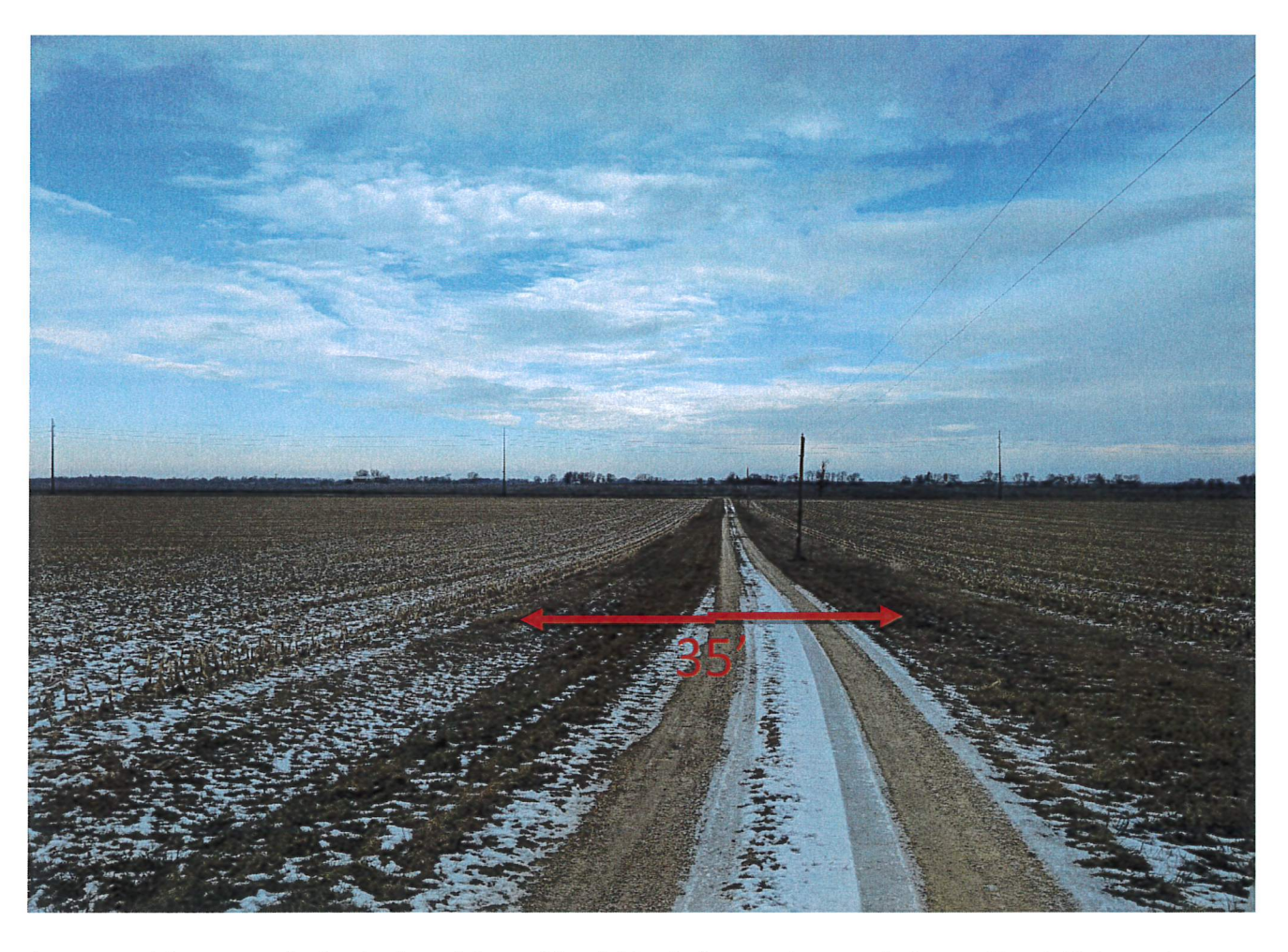
On access driveway at the beginning of the residential lot facing north towards County Trunk Highway P.