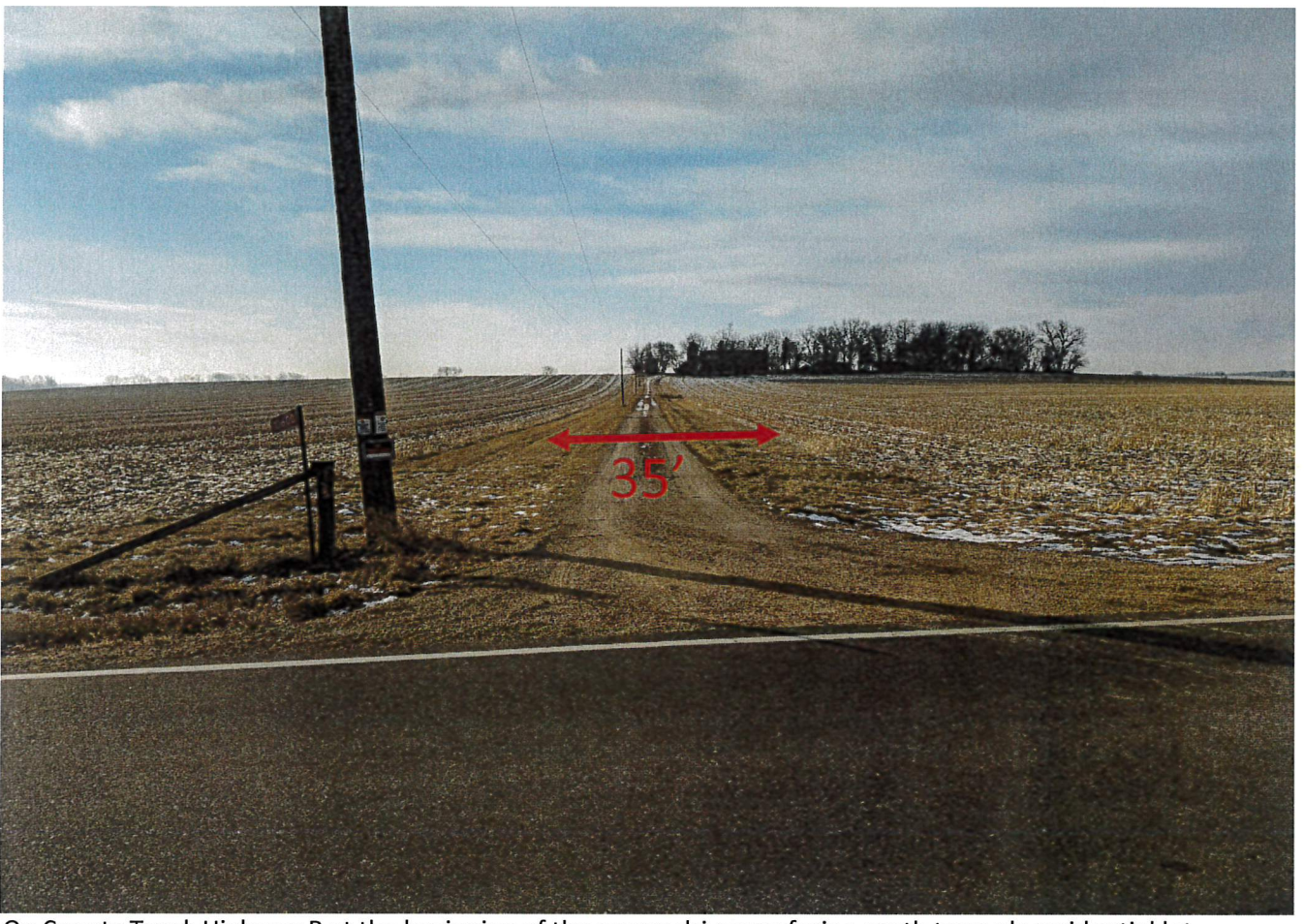
On County Trunk Highway P at the beginning of the access driveway facing south towards residential lot.