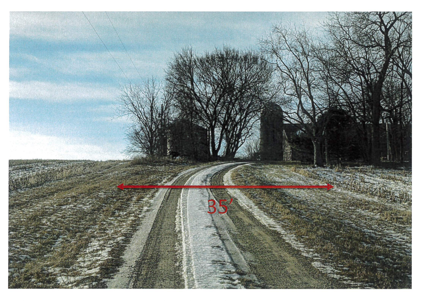
On the access driveway at the beginning of the residential lot facing south.