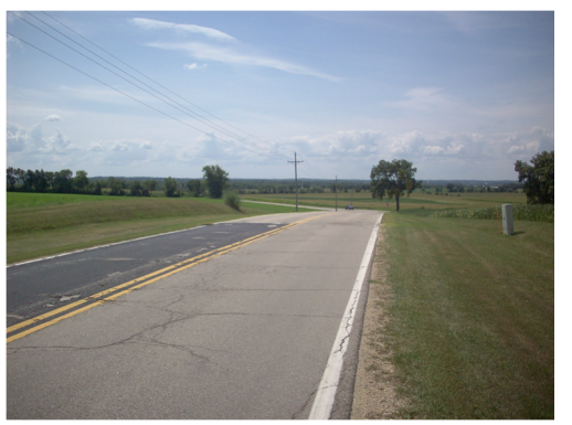
Facing south on CTH F. Poor pavement condition, sharp horizontal curve, poor site distance.