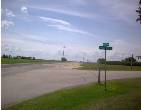
Facing south on CTH F at Pomeroy Road. Inadequate site distance.

The proposed project will replace the pavement, improve roadside drainage, realign several substandard curves, and improve the intersection sight distance. A paved shoulder will also be provided.