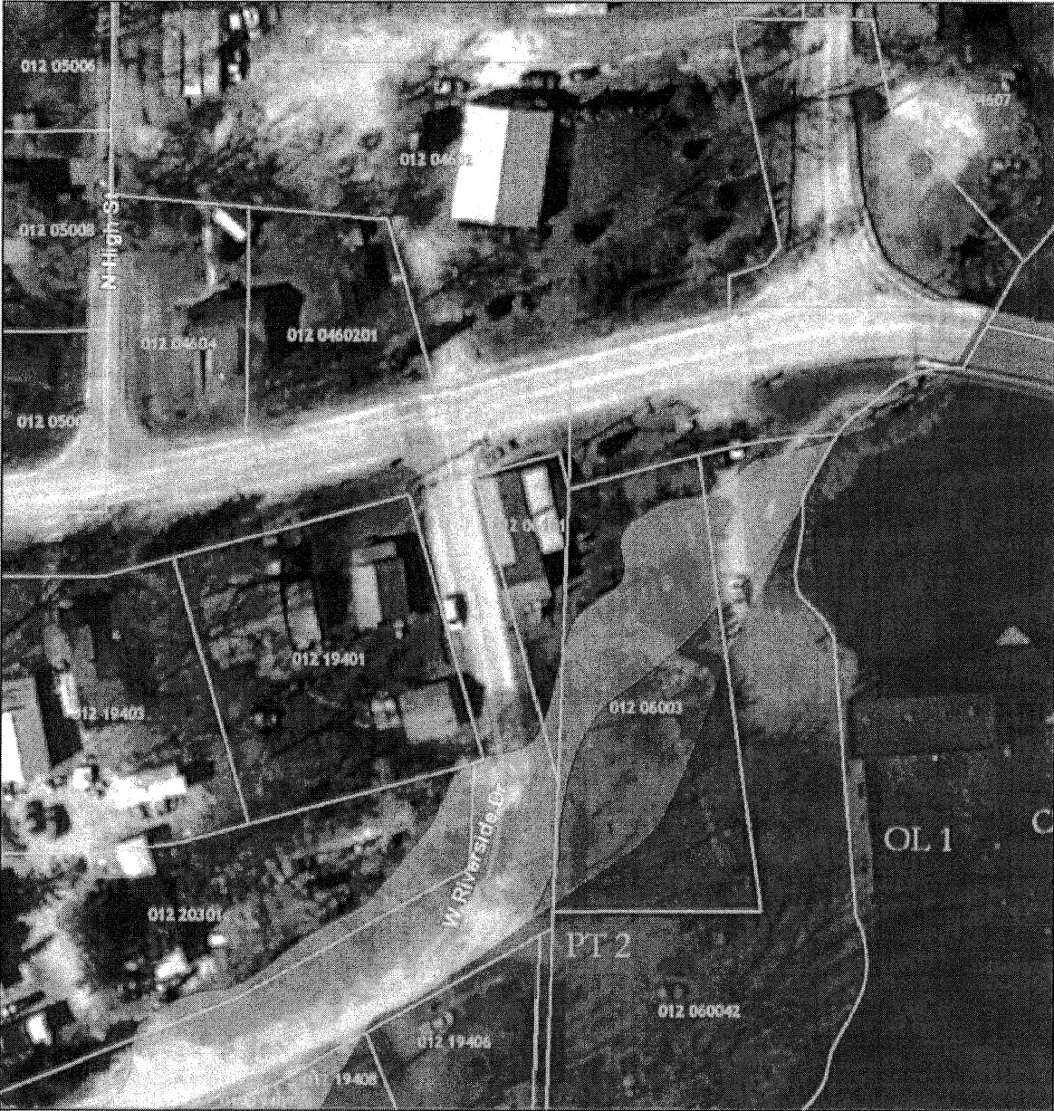
FEMA – Floodplain